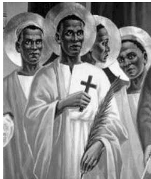
St. Charles Lwanga and Companions

No charge. Free will offerings are always welcome. Call for reservations: (314) 367-7929.