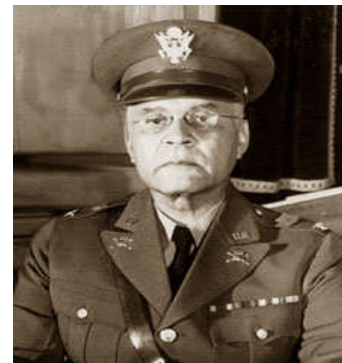
Benjamin Oliver Davis, Sr.

Benjamin Oliver Davis, Sr. ended a brilliant 50 year military career in 1948. During the last eight years of his service, he achieved the distinction of being the first African American general in the United States Army. Davis graduated from Howard University in 1898, and served in the 9th cavalry and the 8th U.S. Volunteers Infantry before joining the Army in 1918. His breakthrough success in advancing through the ranks of the military paved the way for others who followed, and sent a powerful message to the young people—that with education, hard work and determination, the highest goal can be achieved, and that no dream is beyond their reach.