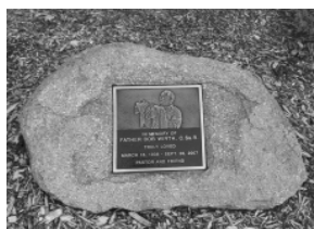
Memorial Brick Garden Sale Campaign COMING SOON....

Amount needed each week to meet budget: $12,000